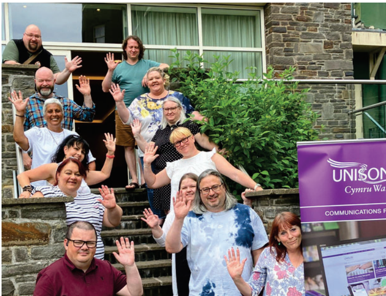
COMMS FORUM MEMBERS AT THE RESIDENTIAL TRAINING IN LLANDRINDOD WELLS 23-25 OF JUNE 2023